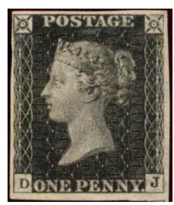
Great Britain #1 Stamp, Queen Victoria

During her time of seclusion, reforms of government in England kept England from the turmoil that was occurring on the Continent.