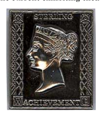
WE Sterling Achievement Medal

The award is not for women exhibitors only – it is given to ANY exhibit (including those by men and youth) that meets the above criteria.