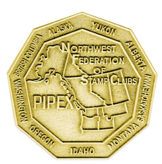
PIPEX Gold Award