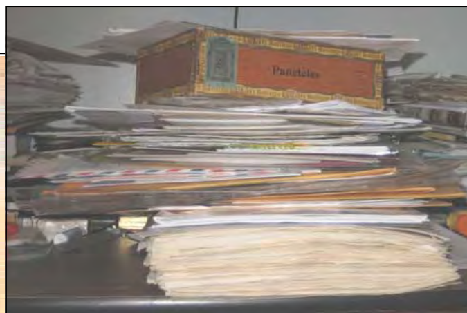
Figure 2: Above, stack of stamps, covers, and a collection that I bought recently at shows. Below: further into stamp room.