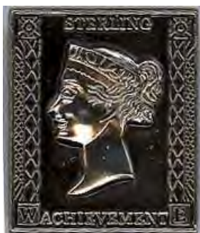
Sterling Achievement Medal