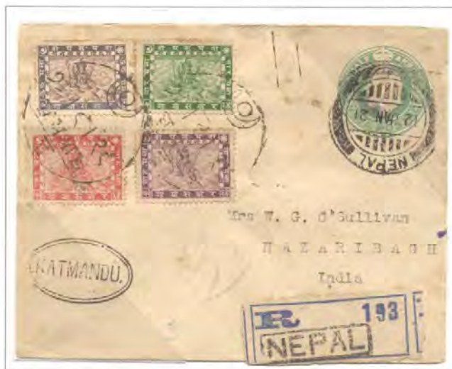
Ghumtang, Nepal, January 1921 franked with complete 1907 Pashupati issue, to Hazaribagh via Kathmandu. In Kathmandu envelope and stamp (on reverse) cancelled 12 Jan 1921 and Registered at the British Residency Post Office for delivery to India; Nepalese stamps were only valid for mail within Nepal.11

These half-anna domestic rate envelopes were issued in 1902 and re-issued in 1907 in two larger sizes. A replacement was issued in 1913 but the Edwardian envelopes continued in service until supplies were used up. This exhibit excludes the overprints on these envelopes for use in the Convention States.