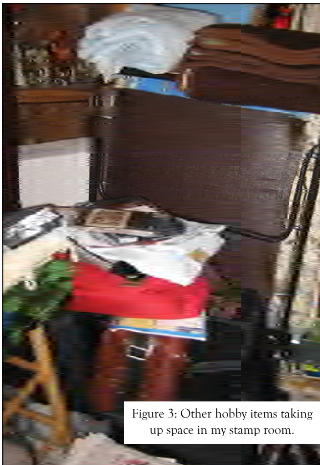
Figure 3: Other hobby items taking up space in my stamp room.

I will continue with Part 2 in Q3 2013 WE Expressions , with more details about what I did to get a clean stamp room. It was challenging but well worth it.