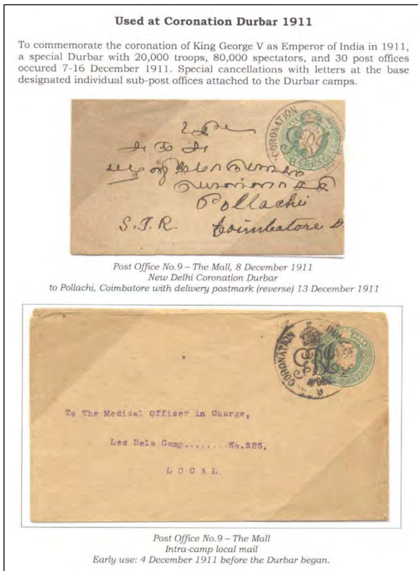
Figure 2: Last page of one-frame exhibit

To illustrate these three suggestions, Figure 1 shows the first page of my one-frame exhibit of Indian One-Half Anna Envelopes of 1902-1907 . It opens with an unusual usage. Figure 2 is the last page of the exhibit. The exhibit ends with Edwardian envelopes used at the Coronation of King George V as the new Emperor of India – an obvious stopping point for an exhibit of Edwardian envelopes. This scarce and attractive usage mirrors that on the first page. These covers are (in Indian philately) impressive pieces. The last page reflects all three aspects of where it is desirable to end an exhibit.