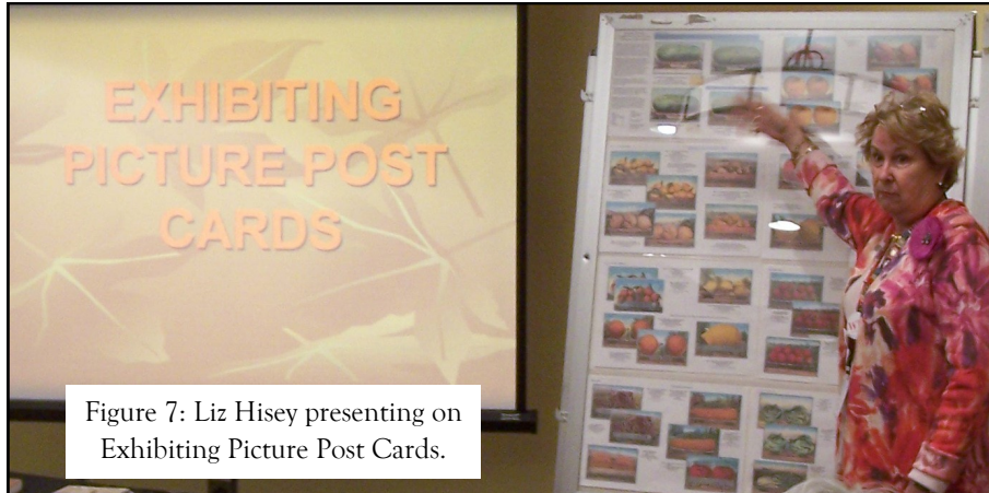
Figure 7: Liz Hisey presenting on Exhibiting Picture Post Cards.