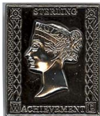
Sterling Achievement Medal

Lawrence Haber - The Hudson Fulton Issue of 1909: First Day Covers and Early Uses at CHICAGOPEX