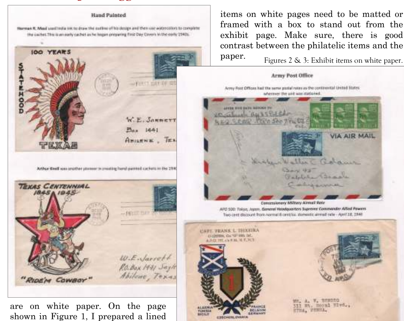
Exhibit Paper Suggestions - continued from page 2