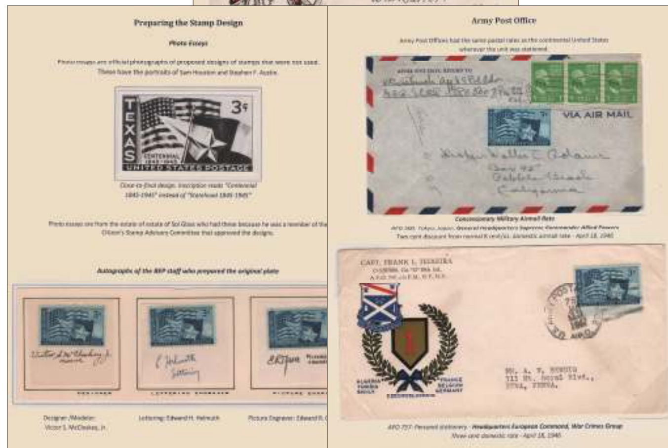
Figures 4, 5 & 6: Same exhibit pages as in Figures 1, 2 & 3, but on tan colored paper.

1. Please, do not use copy paper for your exhibits. Use exhibit paper with a weight that reflects the respect and/or a value commensurate with how you value your exhibit. The weight number used for paper reflects the