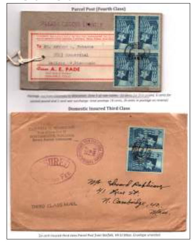
Fig. 1: Page with rate classes.

descriptive text in an exhibit: we have to take the time to be thoughtful and plan how we are going to describe our material. Figures 1 and 2 are pages from an exhibit of the