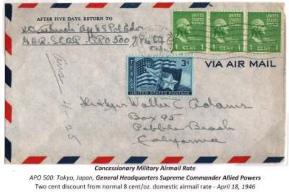
Figure 5. Concessionary Military Airmail Rate on page headed "Army Post Office."

viewer could forgiven for not reading this text; there is too much jumping around to make it easy to follow. There is something even more wrong with this. Page 1 (Figure 1) shows rate classes. Page 2 (Figure 2) is described as Army Post Office. But is that even the best description for the page? Is it the military rate or the type of post office that handled the mail that's important? A better way to head this page would be something like "Active Duty Military Rates."