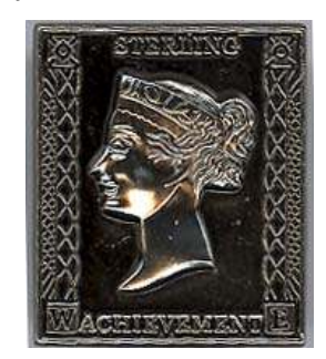
Sterling Achievement Medal