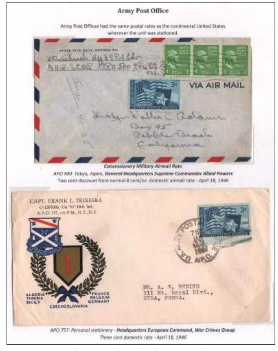
Figures 2: Page named APO but showing active duty rates.

Texas Centenary of Statehood stamp. They look reasonable. Each item is described in a manner that allows viewer to understand what the item is. But – and this is a big but - each item was described on its own without a plan for how descriptive text was to be prepared. The exhibitor dealt with each item independently, not as part of an integrated presentation. Let's look at each in turn.