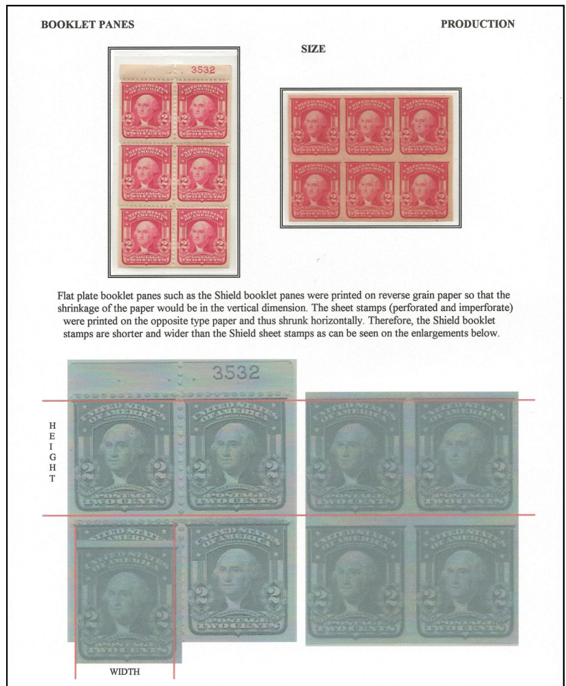
Figure 1: Nick Lombardi's exhibit page.

I wanted to figure out how Nick had made the exhibit page in Figure 1. I made the following assumptions: He prepared the illustration first, to emphasize the elements he was focusing upon then he wrote the description to accompany the illustration. Then, I continued to assume, after these two steps, he figured out the