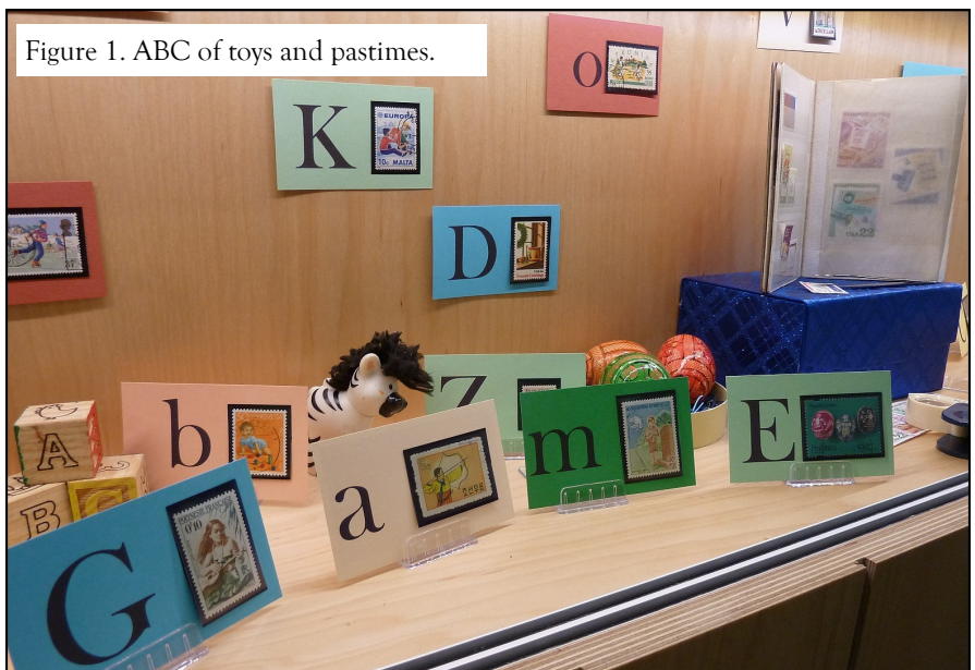
Figure 1. ABC of toys and pastimes.

3. Bears. I did not have many bears on stamps but did have just enough to present four groups of stamps, toy stuffed