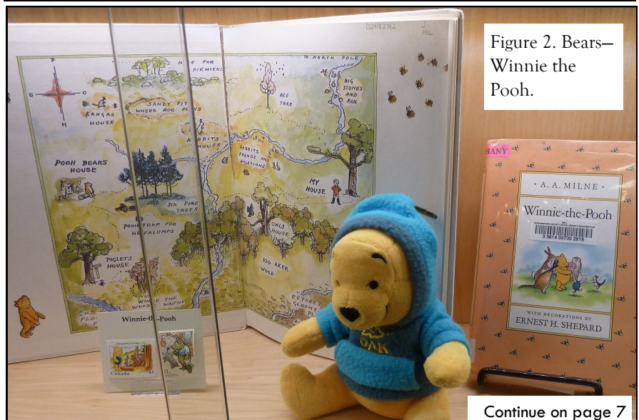
Figure 2. Bears—Winnie the Pooh.