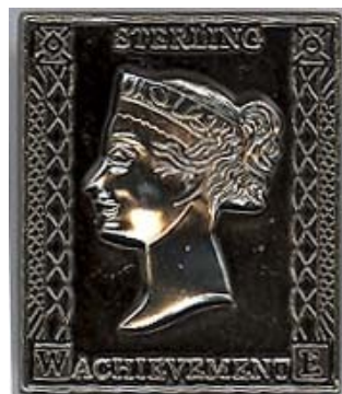
Sterling Achievement Medal