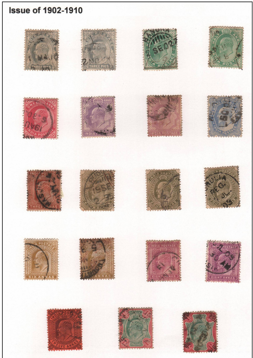
Figure 2: Steve's original Edward VII exhibit page.

Figure 2 is an old page of my Edward VII material. Figure 3 is the current version of the same page. I was pleased with my page when I made it and I am pleased with my page now. I hope I can