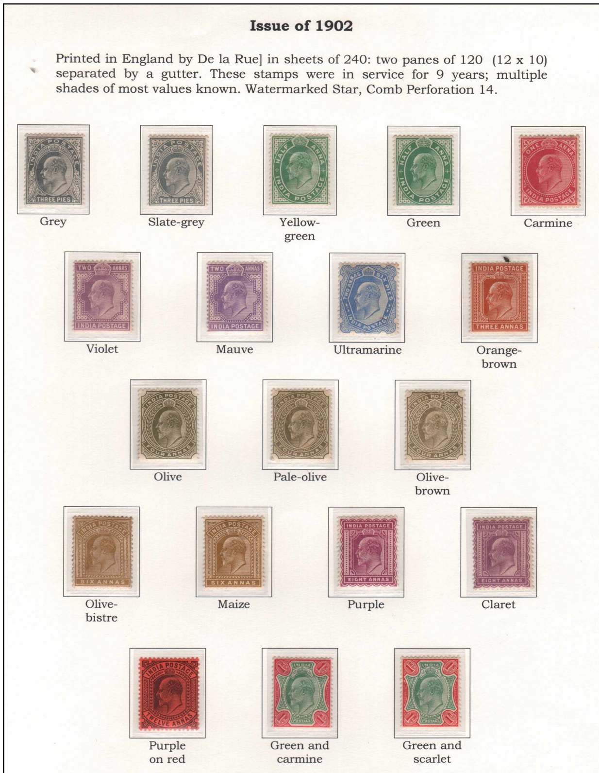
Figure 3: Steve's current Edward VII exhibit page.

looked at my exhibit and thought it was a model for what they'd like to do.