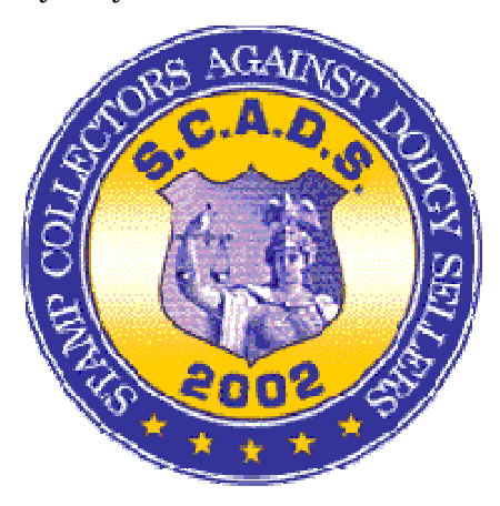
Figure 3: SCADS logo.

At the end of 2000, I started an article on the Florida Forgers on eBay. I also wrote a serious article in 2002 on a New Hebrides NSW Postal Agency cover which was being auctioned in Sydney. That was for the SAS/