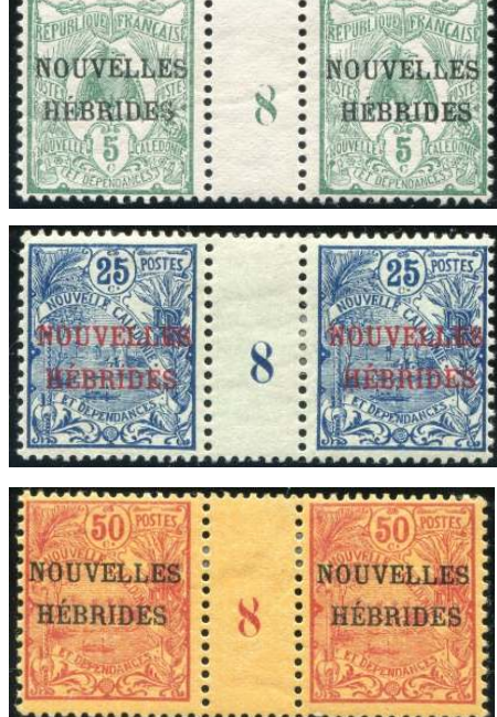
Figure 1: These millesimes were the catalyst for Sheryll to specialize.

more appropriate for a specialized collection. I spent half the next day agonizing over whether I was a specialist or not. I decided I was, called the dealer, asked him to price them for me, and went and picked them up the same day.