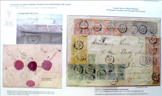
Double exhibit page

If you are mounting the exhibit yourself, the materials can be on one page of your double, the second page can just have the large object's corner mounts on them. The cover or whatever large items can travel on that second page. On the day of the show, the double can be put together at the