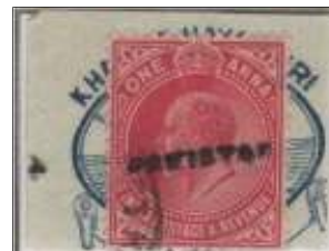
Figure 5: Pakistani overprint on Edwardian stamp.

Pakistani post offices had to scrape up whatever stamps they could find laying around in post offices so they could be overprinted "PAKISTAN". Some of the stamps the Pakistani postmasters found and overprinted were Edwardian stamps. My exhibit now ends with a 1947 Pakistani overprint on an Edwardian stamp (Figure 5), 45 years after the stamp was issued and 9 years after it was demonetized and declared invalid for postage.