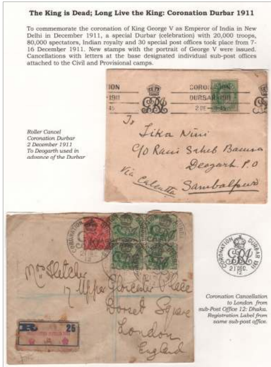
Figure 2: Special cancels for King George V coronation.