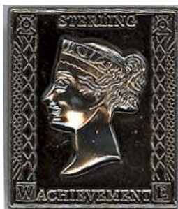
Sterling Achievement Medal