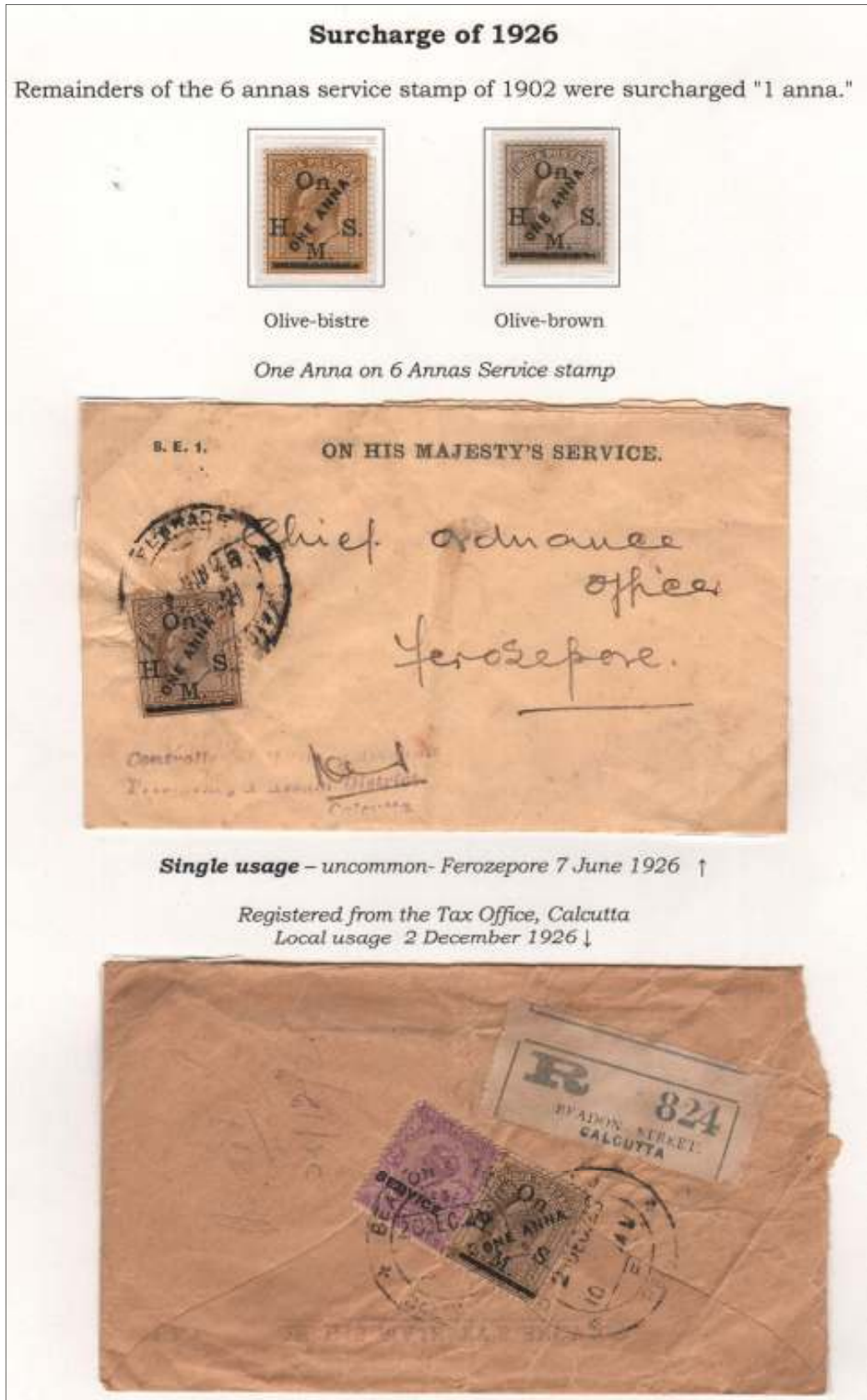
Figure 3: 1926 covers with an official 6 Annas stamp surcharged "ONE ANNA".

Then I found something truly amazing. I acquired a copy of the 1938 Indian Government notice, with its transmittal letter, that announced the demonetization of the stamps of Queen Victoria and King Edward stating that these stamps were not valid for postage after September 1, 1938. These two documents made a wonderful ending (the fourth!) for my exhibits. The announcement is shown in Figure 4. The exhibit now ranged from the introduction of Edwardian stamps to their demonetization and withdrawal: a complete 'life and death' of a stamp issue. I was pleased. Then I acquired something I had wanted for over 15 years that made a new, better, (and the fifth) ending for my exhibit of the stamps of Edward VII.