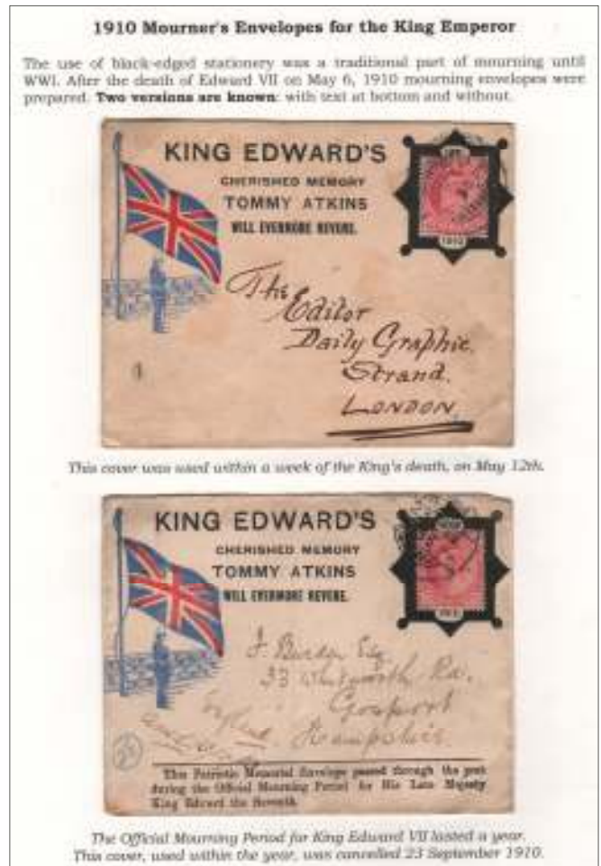
Figure 1: Illustrated covers commemorating the King's death.