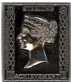
Sterling Achievement Medal