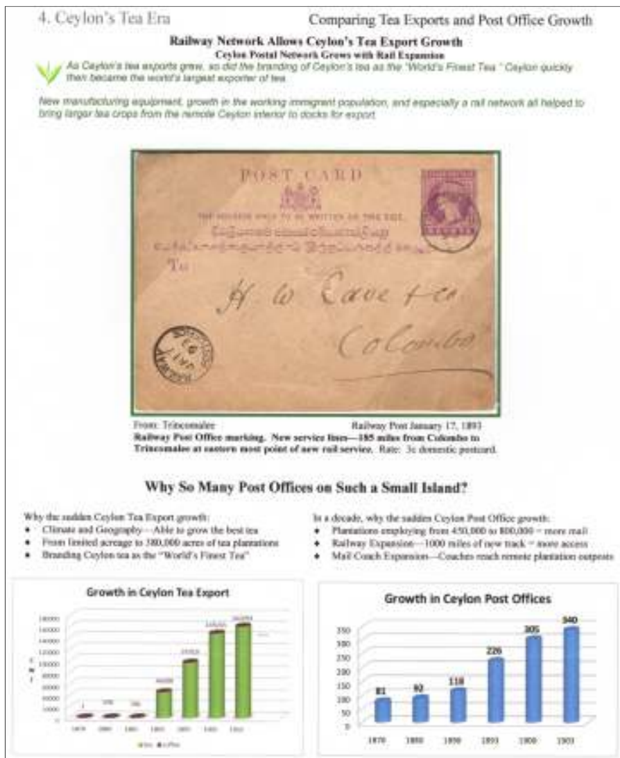
Figure 1: Exhibit page with two bar graphs.