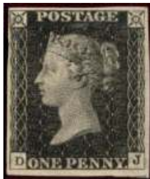
Queen Victoria on Britain #1 stamp.

on 24 May 1819. She was the only daughter of Edward, Duke of Kent, fourth son of