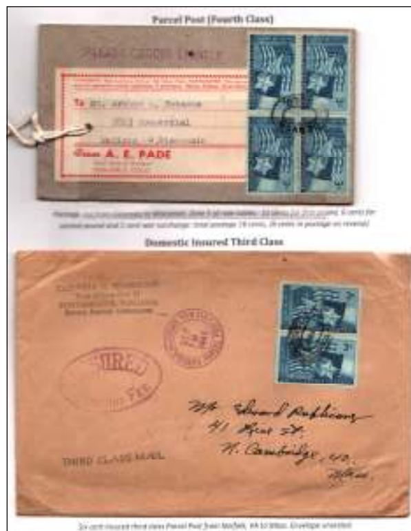
Fig. 1: Page with rate classes. Continue on page 3

descriptive text in an exhibit: we have to take the time to be thoughtful and plan how we are going to describe our material. Figures 1 and 2 are pages from an exhibit of the