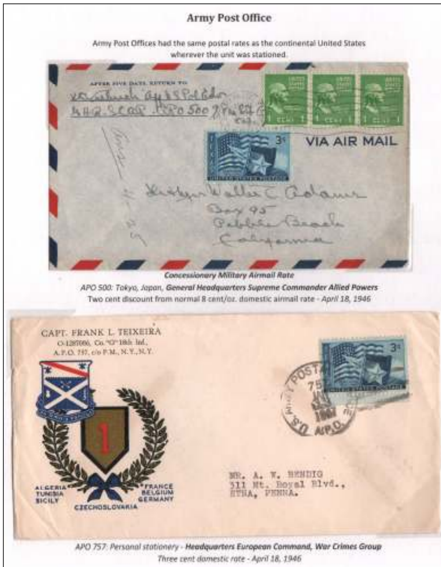
Figures 2: Page named APO but showing active duty rates.

Texas Centenary of Statehood stamp. They look reasonable. Each item is described in a manner that allows the viewer to understand what the item is. But – and this is a big but – each item was described on its own without a plan for how descriptive text was to be prepared. The exhibitor dealt with each item independently, not as part of an integrated presentation. Let's look at each in turn.