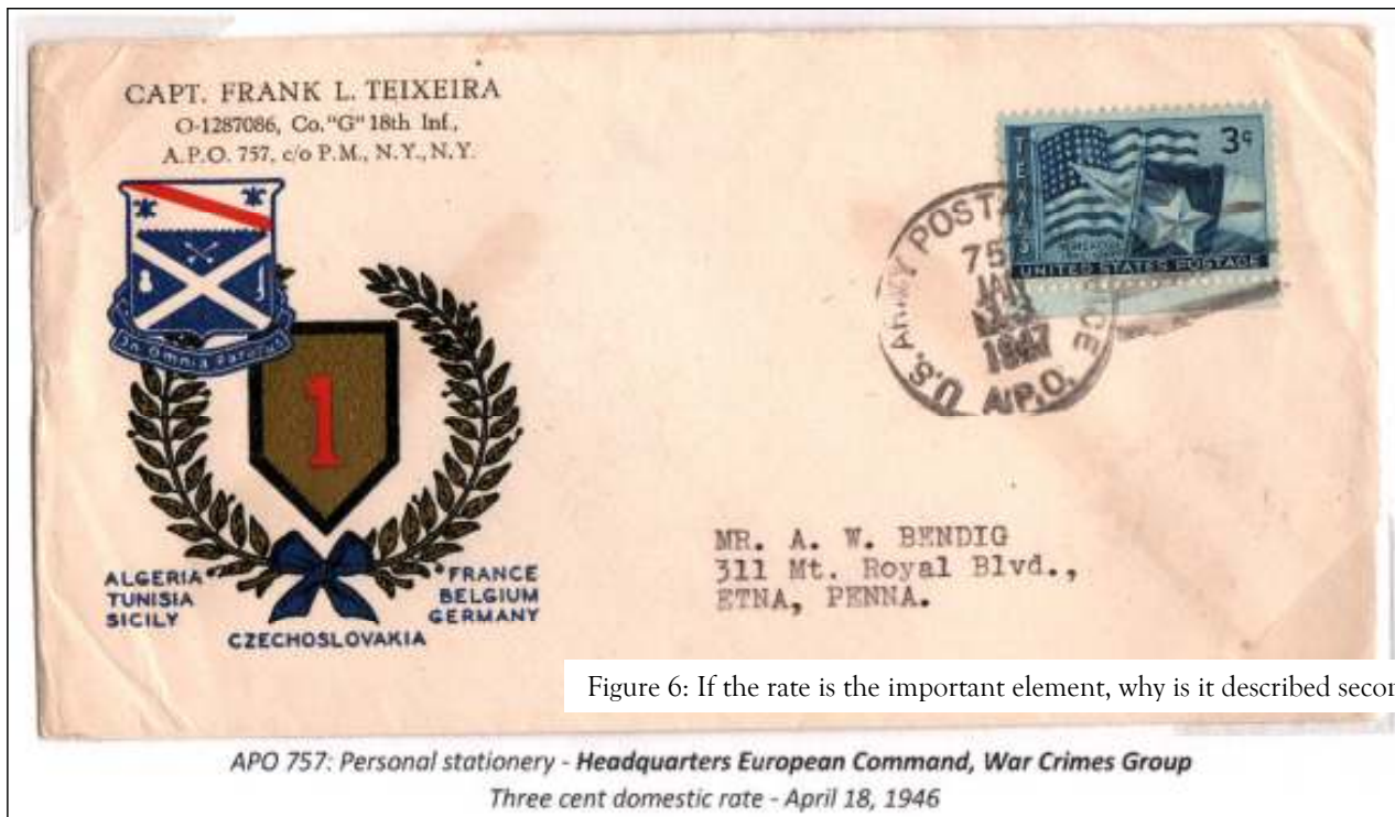
Figure 6: If the rate is the important element, why is it described second?

What do you think? Please send your comments to steven.zwillinger@gmail.com .