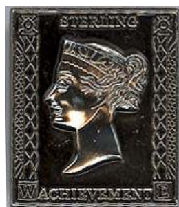
Sterling Achievement Medal