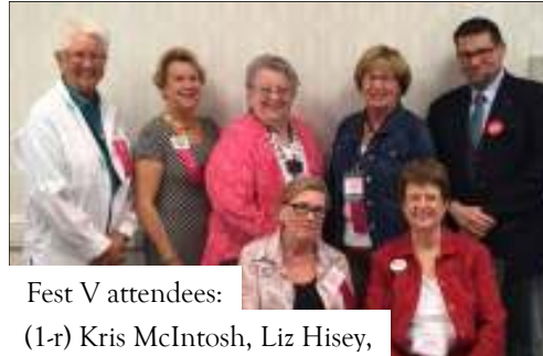
Fest V attendees: