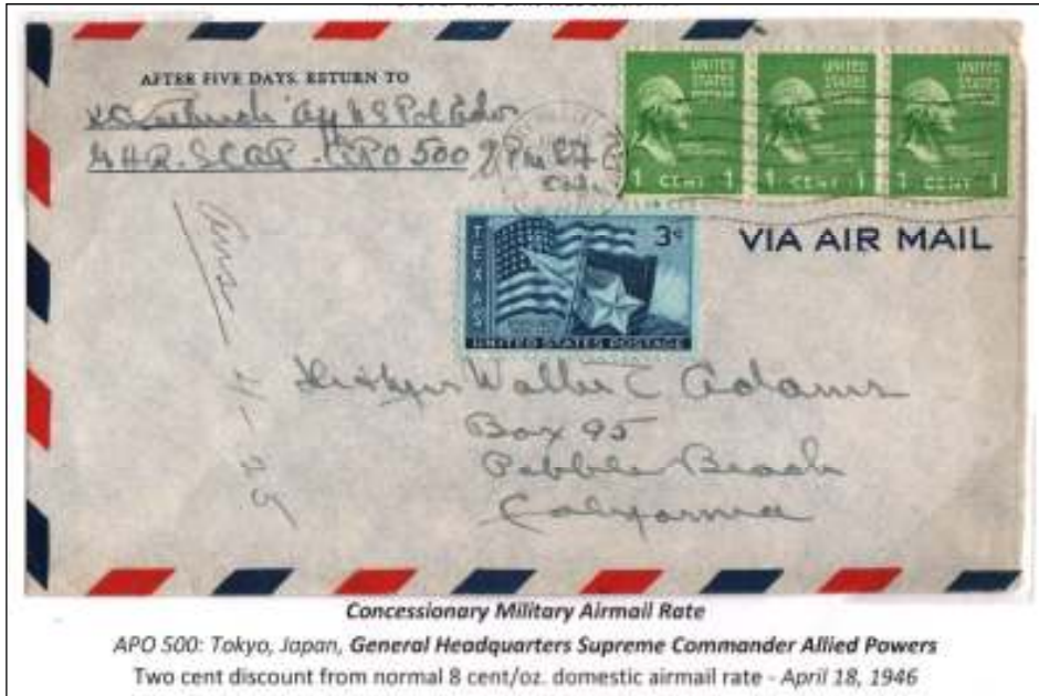
Figure 5. Concessionary Military Airmail Rate on page headed "Army Post Office."

A viewer could be forgiven for not reading this text; there is too much jumping around to make it easy to follow. There is something even more wrong with this. Page 1 (Figure 1) shows rate classes. Page 2 (Figure 2) is described as Army Post Office. But is that even the best description for the page? Is it the military rate or the type of post office that handled the mail that's important? A better way to head this page would be something like "Active Duty Military Rates."