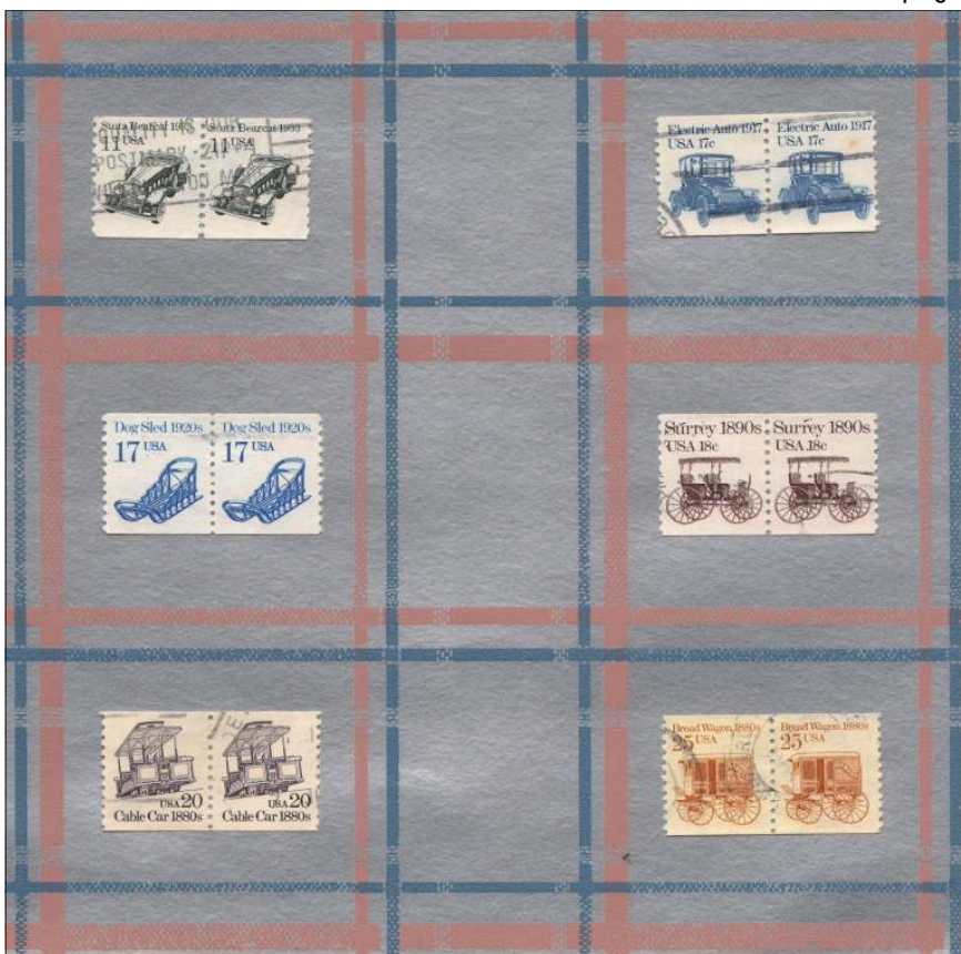
Figure 1: Makeshift exhibit page on wallpaper.