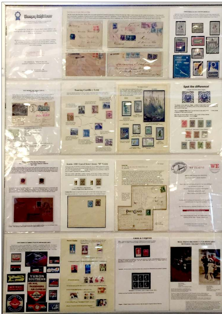
WE one-frame exhibit.