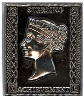
Sterling Achievement Medal