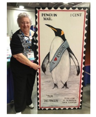
New POSSUM display at Columbus August 2018

Last August at StampShow 2018 our new POSSUM display was released, and I gave an interview to a local television station.