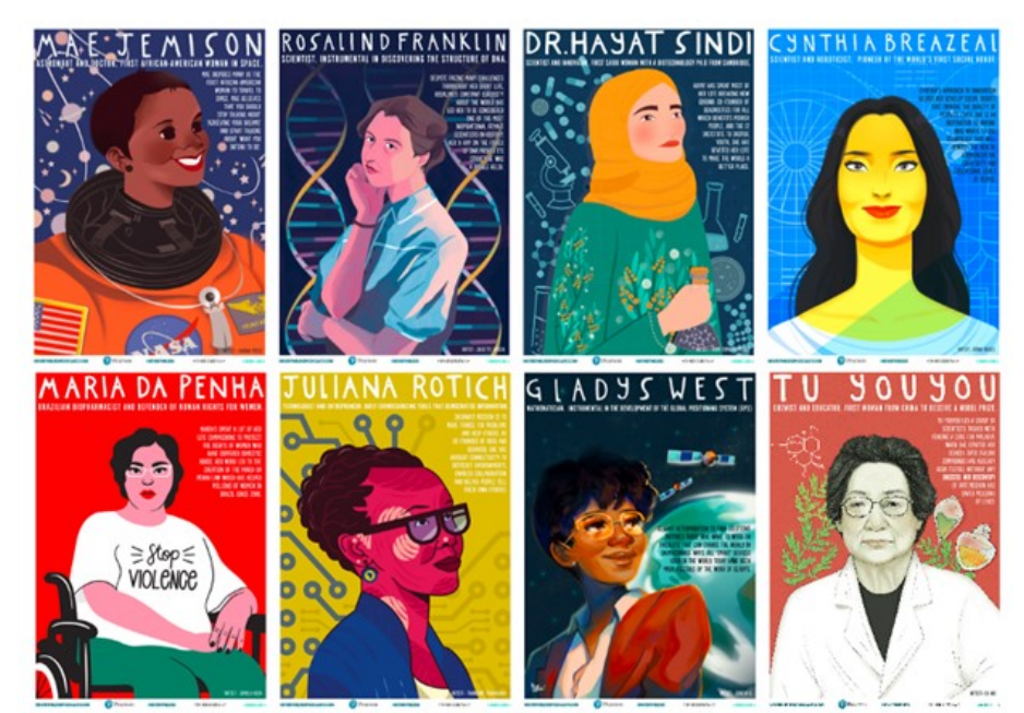
They would also look nice as a cachet paired with the US STEM postage stamp in an exhibit.