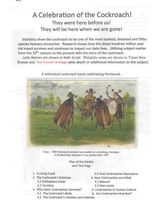
Title page of Jean's "A Celebration of the Cockroach" exhibit, shown at NTSS 2014

A Celebration of the Cockroach was shown at the National Topical Stamp Show (NTSS) held in St. Louis, MO in June, 2014. The judges couldn't believe they were judging an exhibit on such a disgusting insect!