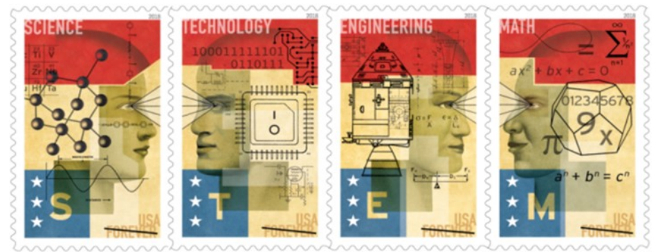
Issued April 6, 2018. Scott #5276-8

https://medium.com/ nevertheless-podcast/stem-rolemodels-posters-2404424b37dd